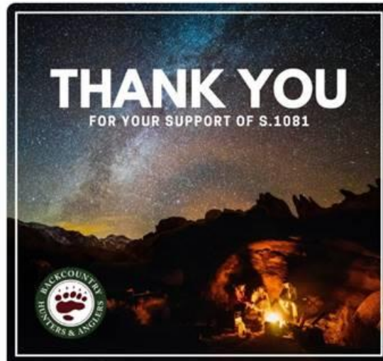
11:59 AM - Apr 10, 2019 - Twitter Web Client

@SteveDaines Thank you for supporting S.1081 to provide permanent and dedicated funding for the Land and Water Conservation Fund. We appreciate leaders like you who stand up for our outdoor heritage and our access to wild public lands and waters. #savelwcf #publiclandowner