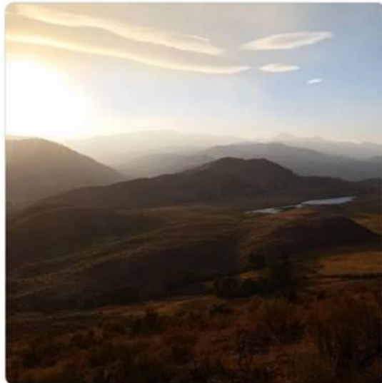
5:04 PM - May 22, 2019 - Twitter Web Client

Thank you to @SteveDaines , @SenAlexander and @SenatorTester for their support of #LWCF in today's hearing on FY2020 Budget Request for the @Interior . These leaders were clear in their message. LWCF is a critically important program to all Americans and it deserves full funding.