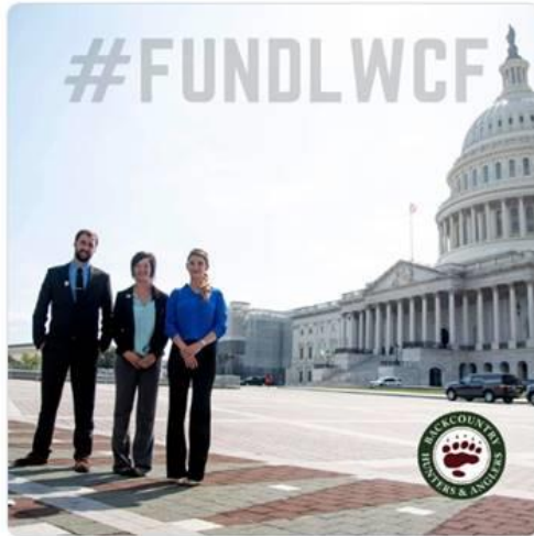
10:12 AM - Sep 18, 2019 - TweetDeck

BHA staffers recently flew to D.C. to advocate for LWCF funding. Leaders are listening to calls from across the conservation community to support this powerful program. Thank you @SteveDaines for meeting with us and for urging House and Senate leadership to #fundlwcf .