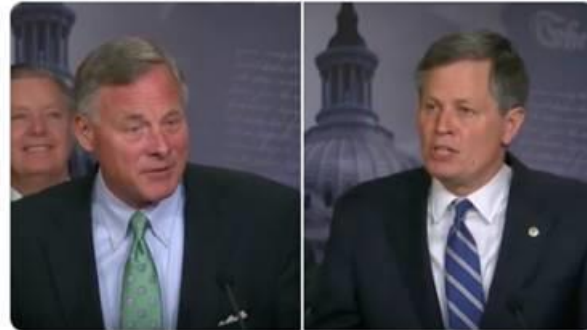
11:47 AM - Jul 10, 2019 - Twitter Web Client

Thank you @senatorBurr and @SteveDaines for your commitment to fully #FundLWCF . We're excited to see the conservation efforts of you and your colleagues in the newly formed Roosevelt Conservation Caucus. #publiclandowner #keepitpublic #lwcf