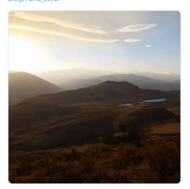
10:19 AM - Sep 27, 2019 - Twitter Web App

Thank you @stevedaines for your comments on #LWCF during the Senate Appropriations markup on the FY2020 Interior bill. We urge your colleagues to stand alongside you and pass legislation that provides full and dedicated funding for LWCF. #FundLWCF Click: bit.ly/Fund_LWCF