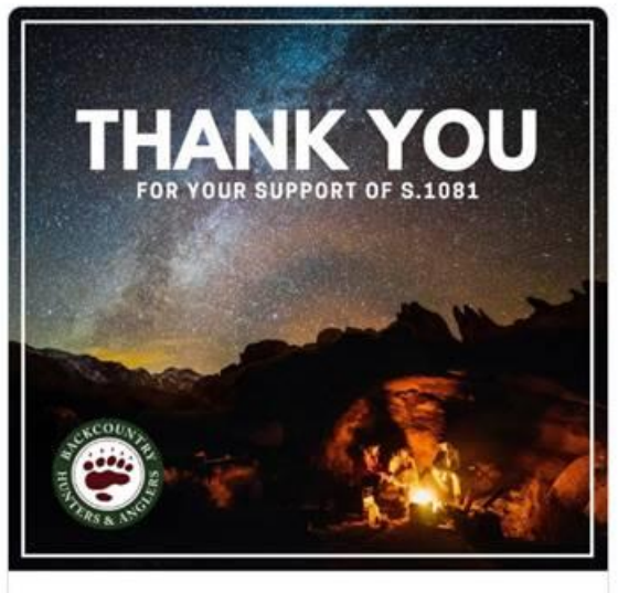
11:59 AM - Apr 10, 2019 - Twitter Web Client

@SteveDaines Thank you for supporting S.1081 to provide permanent and dedicated funding for the Land and Water Conservation Fund. We appreciate leaders like you who stand up for our outdoor heritage and our access to wild public lands and waters. #savelwcf #publiclandowner