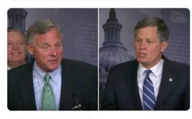
11:47 AM - Jul 10, 2019 - Twitter Web Client

Thank you @senatorBurr and @SteveDaines for your commitment to fully #FundLWCF. We're excited to see the conservation efforts of you and your colleagues in the newly formed Roosevelt Conservation Caucus. #publiclandowner #keepitpublic #lwcf