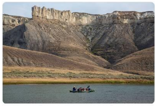
1:28 PM · Feb 1, 2019 · Twitter Web Client

Thanks to @SenatorTester & @SteveDaines for working to bring permanent reauthorization for LWCF to a floor vote in the Senate next week! Let's pass this swiftly and focus on the final goal: full dedicated funding! #savelwcf